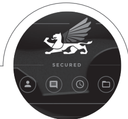
Real-time encryption of all voice, chat, SMS, email, & data file attachments